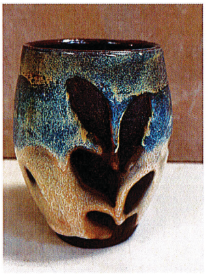
GLW46 Northern Lights CC535D Dark Chocolate