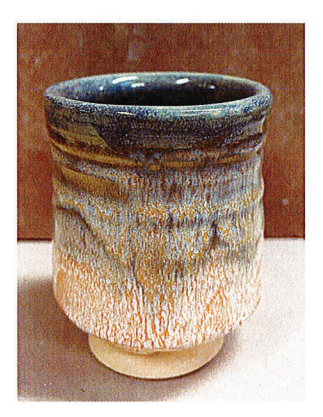
TD510 Halo Purple OVER TD514 Milk & Honey CC529 White Salmon Clay