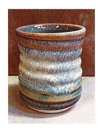
TD514 Milk & Honey OVER GLW46 Northern Light -- heavy application --CC529 White Salmon Clay