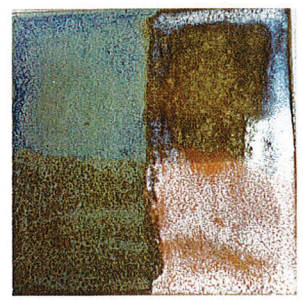
TD510 Halo Purple