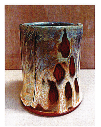
TD510 Halo Purple CC552 Mazama Red