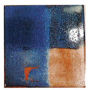
PG607 Nassau Blue