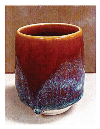
TD514 Milk & Honey OVER PG651 Mottled Brown CC519 Silver Falls Clay