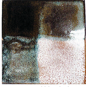
PG602 Incredible Black