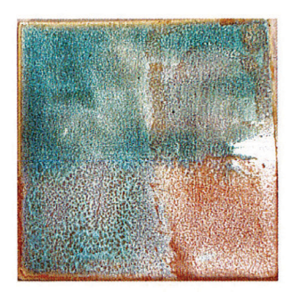
PG642 Blizzard Blue