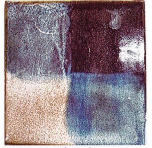
TD511 Purple Velvet