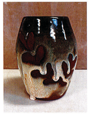
PG602 Incredible Black CC535 Trail Mix Cinnamon