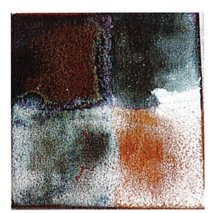
GLW46 Northern Lights