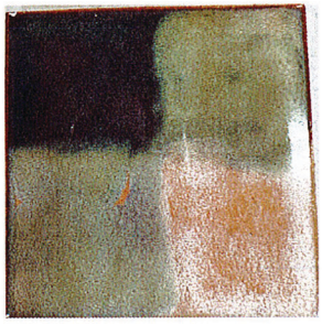
TD503 Tidal Pool