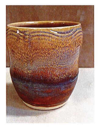
TD514 Milk & Honey OVER GLW46 Northern Lights CC529 White Salmon Clay