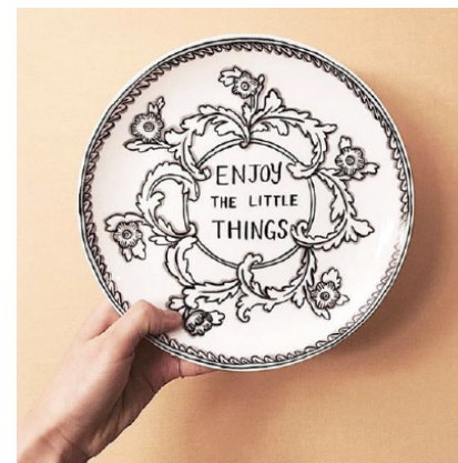
Graphic Detailing Molly Hatch