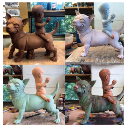
Surface Staining Travis Winters