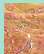
O-30 Autumn Leaf over V-380 Violet