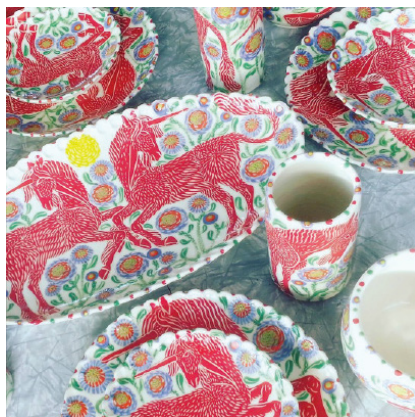
Sgraffito Sue Tirrell