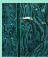
O-26 Turquoise over V-353 Dark Green

You can layer AMACO Opalescent glazes over Velvet Underglazes for brilliant pops of color and colorful combinations! This technique is most dynamic on textured surfaces.