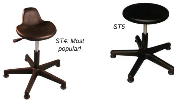
ST4: Most popular!