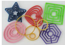
Each set of 4 has a: 1.5", 2.5", 3.5" & 4.5" shape