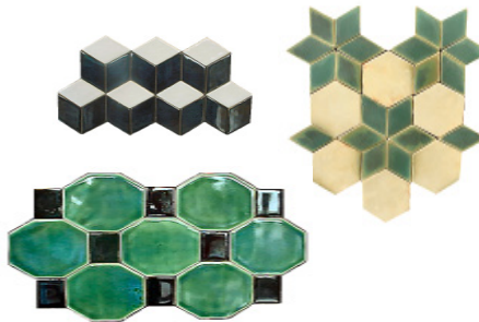
These patterns were made with Georgies tile cutters and cone 6 glazes. Visit our website for a brochure with more pattern ideas.