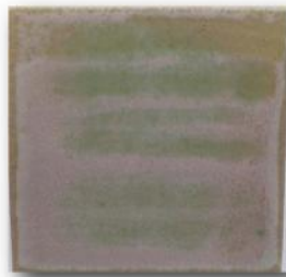
GLW36 NW Woods matte, stays much the same..pinkish when thick