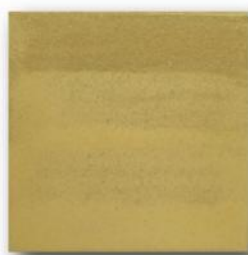
GLW21 Raw Honey matte w/ deeper gold tones