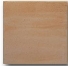
GLW39 Vanilla Cream matte w/ deeper blush tones