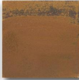
GLW26 Mustard Wood Ash matte w/ deep burnt orange...rich