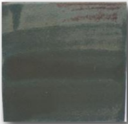
GLW47 Kalamata matte w/ greener overall tones