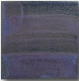
GLW10 Midnight Blue matte blue-purple w/ crystal trend