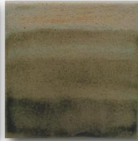
GLW27 Emerald Wood Ash more matte / shiny where thick