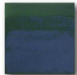
GLW42 Blueberry Matte matte w/ bright blue/green when thin