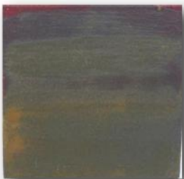
GLW22 Rusty Nails unchanged