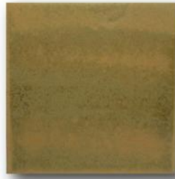
GLW33 Crystal Topaz more intense crystal growth