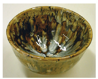
CR904 (discontinued) with SC16

This technique will also work with Envision Glaze combinations!