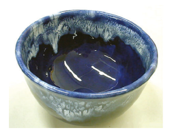
IN1075 Cobalt Blue with SC16

Small Crystals: Mix the crystals from the bottom of the jar into the glaze for all 3 coats. Do not let crystals collect toward the bottom of the jar.