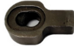
H-EXTRD-GP05 Grip Plate