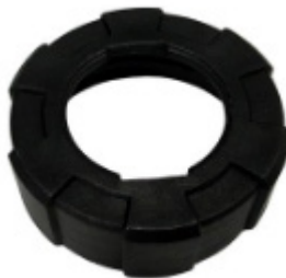
H-EXTRD-BEC Black End Cap