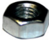
H-EXTRD-M8HN23 M8 Hex Nut #23