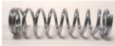
H-EXTRD-GPS09 Grip Plate Spring