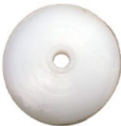
H-EXTRD-WPD Plastic Extruder Plate