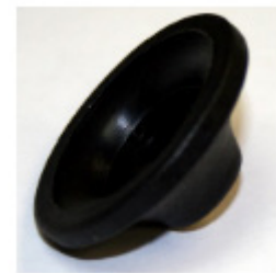
H-EXTRD-PULL Plastic Plunger Pull