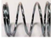
H-EXTRD-TRS04 Trigger Release Spring