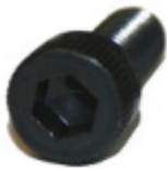
RSSAA004010 Socket Head Cap Screw for Hollow Die (M4 x 10 mm)