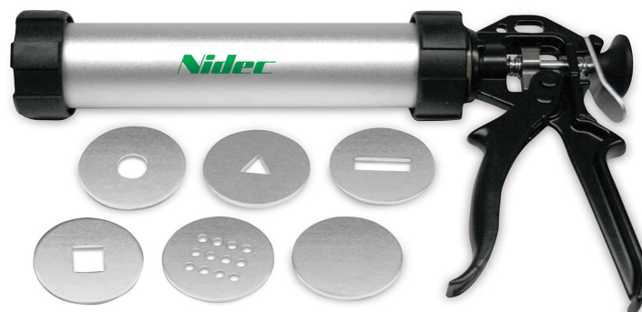
6 Shimpo bonus dies

Valued at $261.00 if purchased separately.