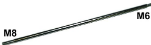
H-EXTRD-TMS Threaded Metal Shaft (M8/M6)