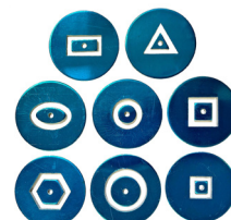
GEXHB bonus dies