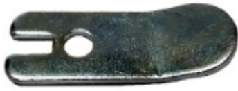
H-EXTRD-TR03 Trigger Release