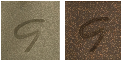
CC531 • Santiam