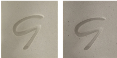
CC502 • Mt Hood Porcelain