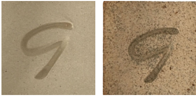
CC505 • Cannon Beach