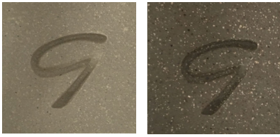
CC506 • Cookspride