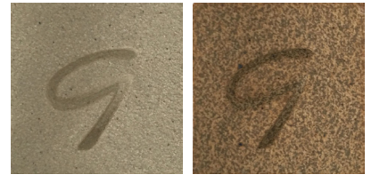
CC512 • Three Finger Jack