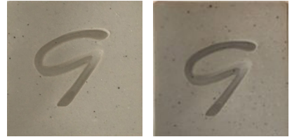
CC532 • Umpqua White