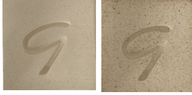
CC518 • G-Mix 10