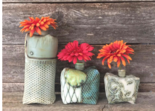
Slumping Vases by Stephanie Burton

Georgies Interactive Pigments are blends of natural mineral oxides that work in ALL firing ranges: