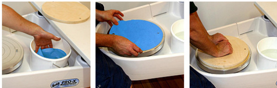
Soak in water Place on wheel Press bat down

Hold down loose, worn bats and keep them from wiggling or flying off the wheelhead. Just wet it, set it and forget it! The durable material applies an ideal amount of gripping power, and will not crack or become brittle as it dries.