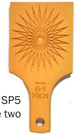
SP5 Side two