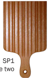
SP1 Side two