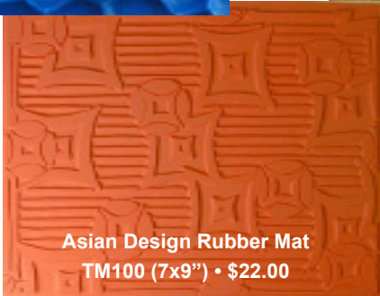
Asian Design Rubber Mat TM100 (7x9") • $22.00