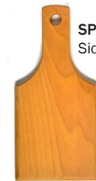
SP5 Side one