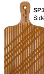
SP1 Side one

MKM's hardwood paddles are soaked in hot mineral oil or tung oil to seal the wood for durability and moisture resistance. All paddles are 0.45" thick, and the edges are rounded for comfort in your hand. The pattern area on short paddles measures 5¼" x 4½", and the long paddles measure 8¾" x 4½". Either paddle is $14.95 each.