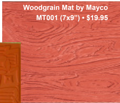
Woodgrain Mat by Mayco MT001 (7x9") • $19.95