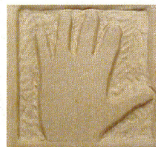
CC509 • Pioneer Dark

The color difference in clays affects your glaze results.