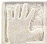
CC520 • G-Mix 6

The samples on this flyer are shaped like taco shells: flat clay rounds incised or stamped with texture, then folded in half for glazing and firing. The class students chose all their own patterns and designs, so no two are quite the same. Clay color interacts with and changes glaze color results. Unless otherwise noted, all the "tacos" were made from our G-Mix 6 clay. We had originally planned to use these images in our catalog but ran out of space. Instead, we are presenting them on our website and as a companion to the "Combo Mambo" flyer.