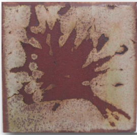
GLW22 under waxed design GLW36 NW Woods