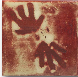
GLW22 under waxed design GLW32 Latte