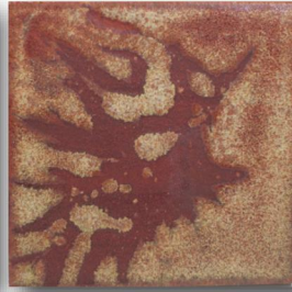
GLW22 under waxed design GLW30 Cinnamon